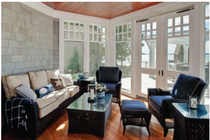
ABOVE: The family's expansive patio is typically full of activity with friends and family providing a steady stream of visitors throughout the summer.