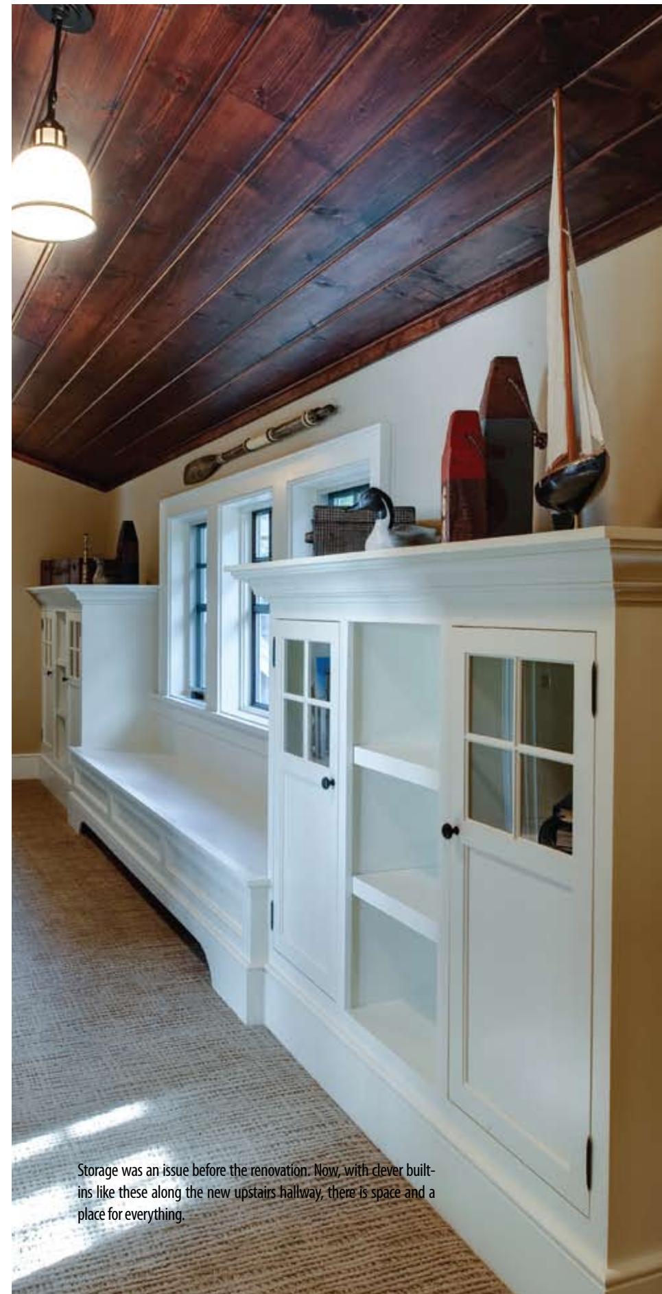
Storage was an issue before the renovation. Now, with clever built-ins like these along the new upstairs hallway, there is space and a place for everything.