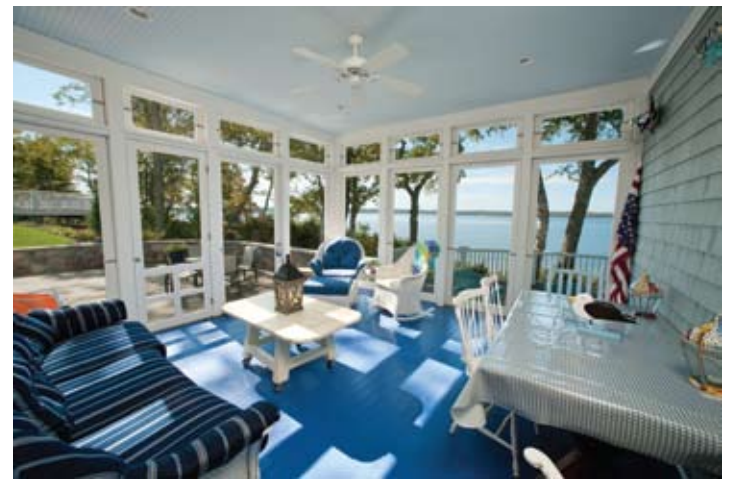
OPPOSITE PAGE: Windows, windows, white and bright. An artist studio is void of distraction and ready for the next masterpiece moment.