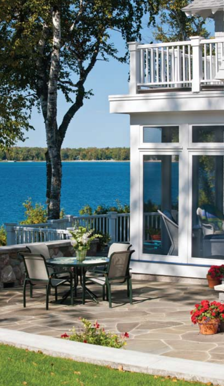
ABOVE: There really is a place where the grass screams green and the blue blinds. It's here, in all the tips and bays of a magical place called Northern Michigan.

Building Supplies: NORTHERN LUMBER CO. Electrical Work: ADVANTAGE ELECTRIC Fireplace: SOURCE JULIEN INC. Flooring: FLOOR COVERING BROKERS Granite & Tile: STRATUS MARBLE & GRANITE HVAC: TEAM BOB'S Kitchen Appliances: MAX'S SERVICE Well Drilling: B & Z WELL DRILLING