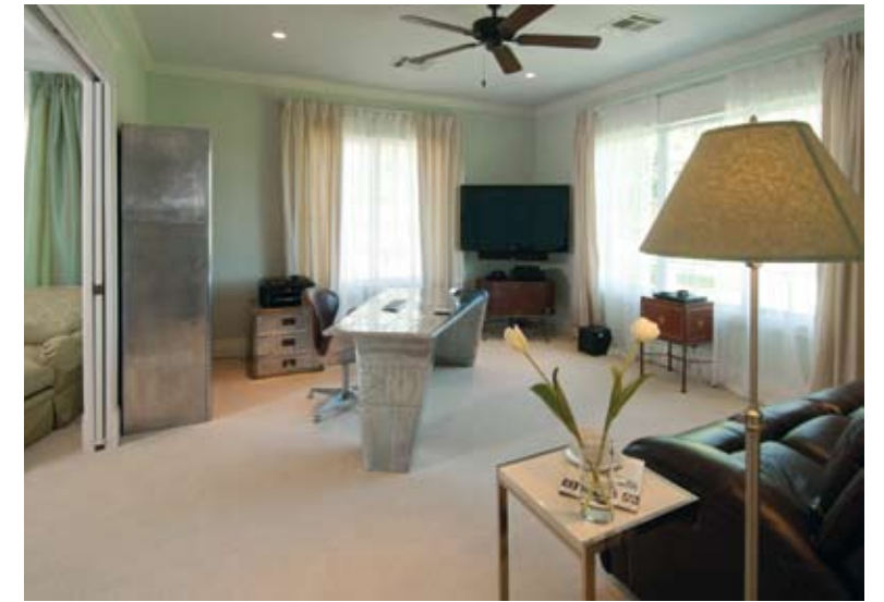
ABOVE LEFT: His and her vanities, adorned with sconces, highlight the master bath amenities. ABOVE RIGHT: The master suite offers a private office/living space. BELOW: A continuity of elegance is paramount in the master bedroom.