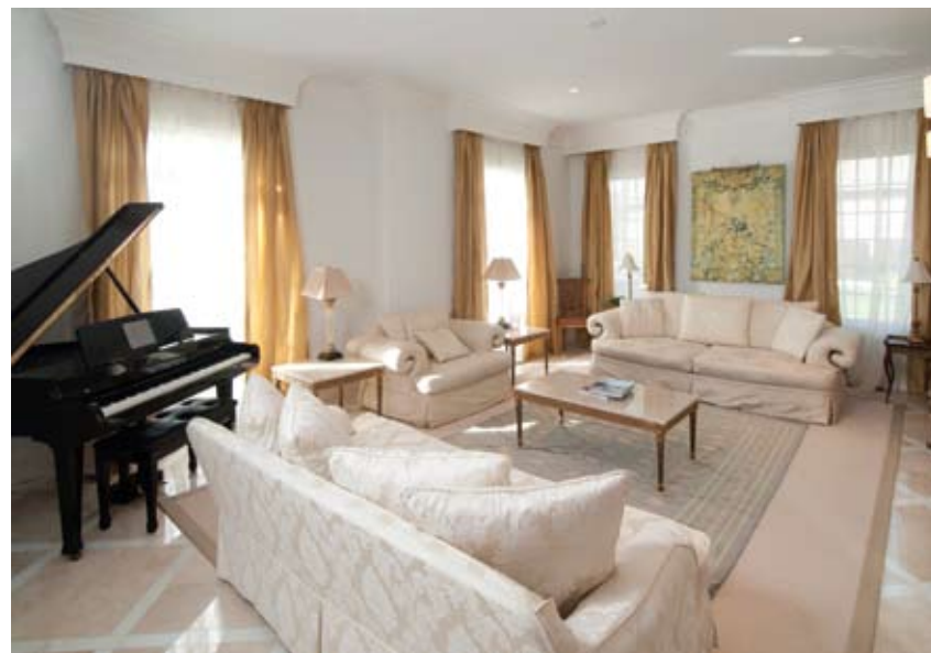
ABOVE: Along with a variety of finishes and countertop selections, the kitchen is accented with moldings and rope lighting. BELOW LEFT: The formal dining room elegantly combines traditional columns with a modern fireplace. BELOW RIGHT: Drapery panels add drama to elegance and a neutral color palette.