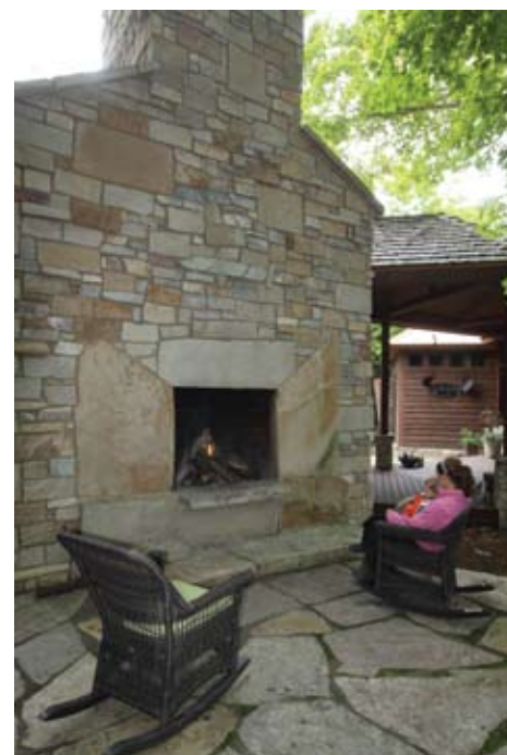
TOP: Most of the couple's entertaining is done in the outdoor living area.

Windows are removed and replaced with canvas roll-up shades.