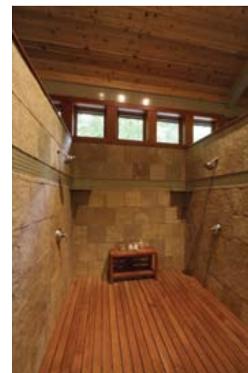
MIDDLE LEFT: The spacious walk-in shower is constructed of indigenous materials and is flooded with natural light.