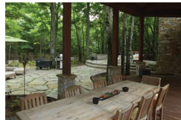
TOP: This modern kitchen provides the homeowners with an outstanding indoor dining venue. BOTTOM: A covered area provides a place for outside relaxation—rain or shine.

Brick/Stone Supplier: AUTUMN RIDGE STONE & LANDSCAPE SUPPLY Cabinetry/Countertops/Hardware: KITCHENS WEST Engineering/Steel Beams/SIPS (Structured Insulated Panels): PORTER SIPS Hardwood Flooring/Tile Supplier/Installer: INTERIOR IMAGES Plumbing Contractor/Fixtures: ALL-STAR PLUMBING INC. Roofing Supplier/Installer: SECURE ROOFING AND CONSTRUCTION