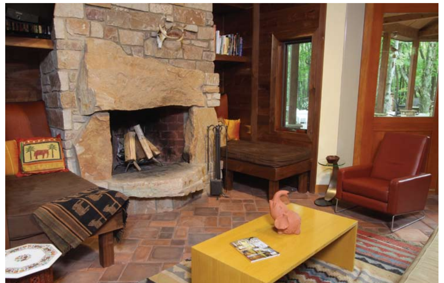
BELOW: The window seats invite guest to relax and enjoy the views.