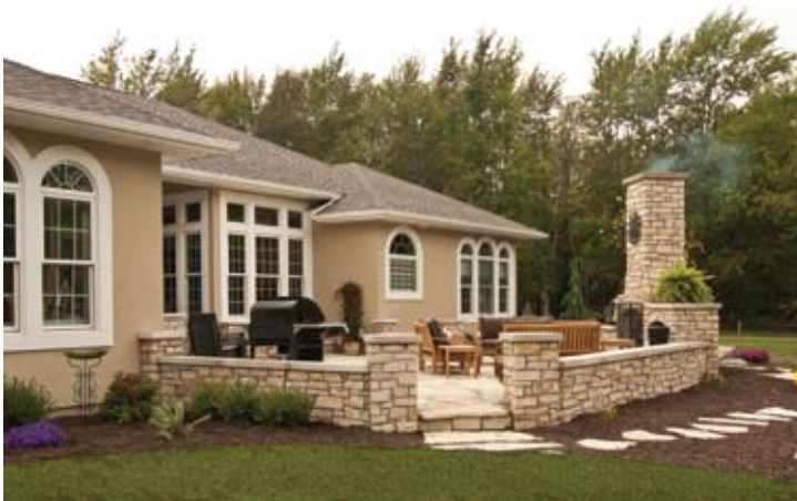
ABOVE: An outdoor living space offers a place to enjoy natural splendor.