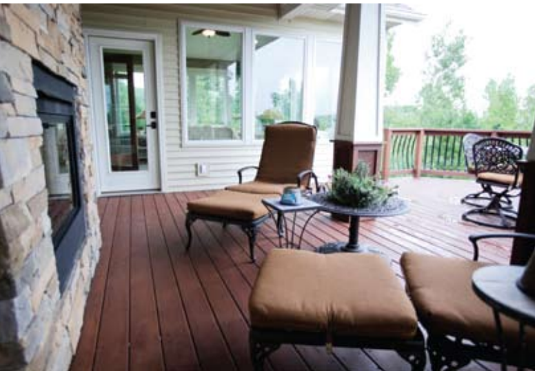
TOP: Sophisticated and timeless, shades of white never go out of style. MIDDLE: A billiard area is one of the many areas of the man cave. BOTTOM: An outdoor living space, with double sided fireplace, is enjoyed spring through fall.

Building Materials/Doors & Windows: STANDARD SUPPLY & LUMBER Custom Cabinetry: WOODWAYS Door & Cabinet Hardware: MODERN HARDWARE Overhead Doors: ZYLSTRA DOOR INC.